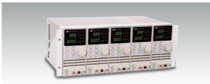
IT-E152 19" rack mount diagram