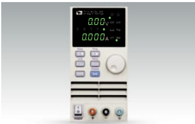
IT6720 60V/5A/100W IT6721 60V/8A/180W