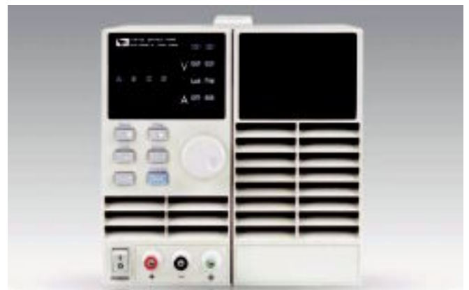
Rear panel of IT6720/6721